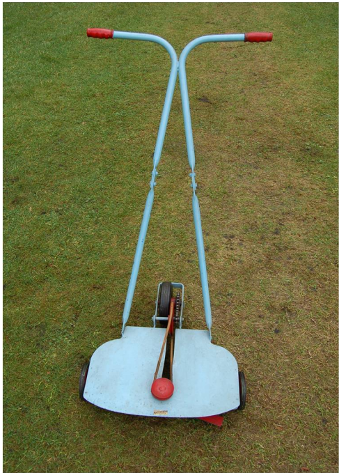
Mowright Wizza 12in ©1955 Hand