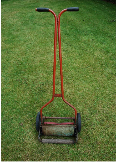
Qualcast B1 sw 12in ©1965 Hand